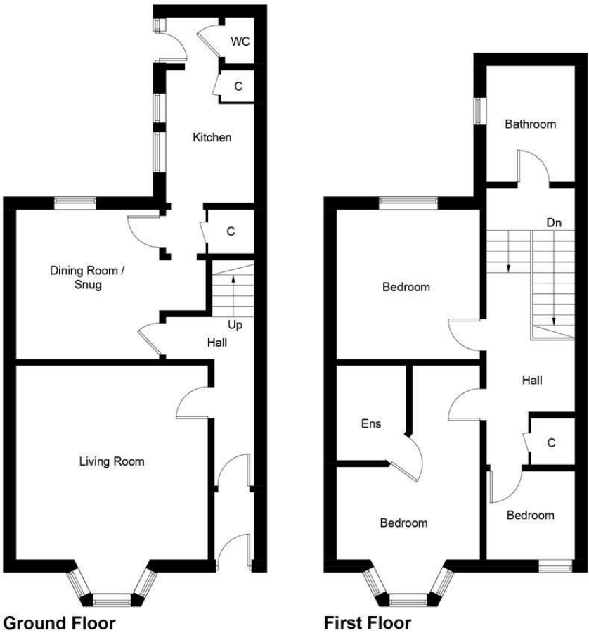
Illustration for identification purposes only, measurements are approximate, not to scale. (ID1240547)